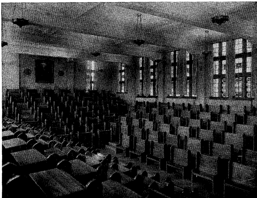
Lincoln Hall—The Law School Class Room in which the Prosecutor's Course Was Conducted