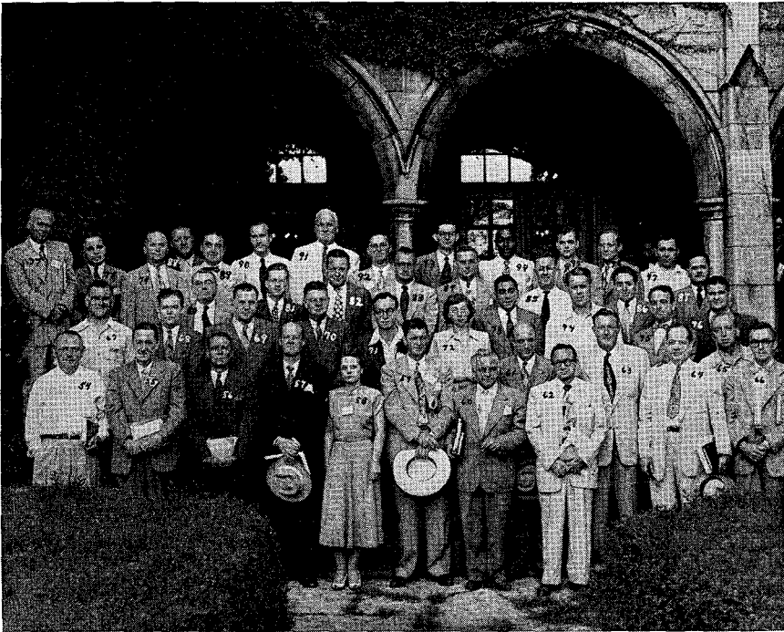
Attendants at 1949 Short Course for Prosecuting Attorneys