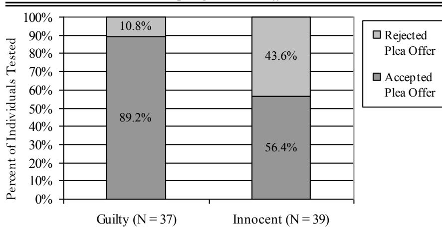
Figure 2 Percentage of Students by Condition (Guilty or Innocent) Accepting the Plea Offer

Interestingly, these results are consistent with predictions made by other scholars relying on case studies to predict the impact of innocence on plea-bargaining decisions. 185