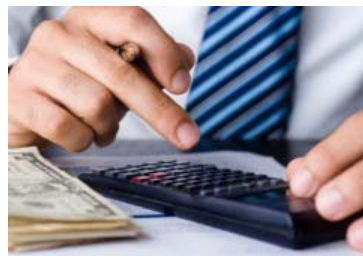
10 Steps To Boost Your 401(k)