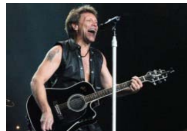
The Top Celebrity Charity Relationships