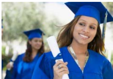
Ten Ways To Pay For College Right Now