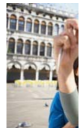
Essential G Smarter Tr