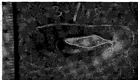
FIGURE 2. Bullet Hole Without the Passage of the Bullet (.45 jacketted bullet against \frac{1}{16} " steel plate at 30^\circ incidence)

Experiments showed that .22 lead bullets and .38 jacketted bullets could only penetrate aluminium targets ( \frac{1}{16} " & \frac{1}{8} ") and not the other ones when "Normal Firing" was undertaken from the same distance as adopted in ricochet studies. The .45 jacketted bullets could not penetrate brass and steel targets ( \frac{1}{8} ") but could penetrate the others under similar conditions. It is obvious that a bullet fails to ricochet by disintegrating on targets which it is incapable of penetrating. It will fail to ricochet by penetrating or disintegrating on those targets which it is capable of penetrating. In some cases penetration and disintegration may simultaneously occur and only a part of the bullet may actually pass through the hole. A glance at the Remarks column of tables 2 to 4 shows this to have happened. When the .45 jacketted bullet was fired on \frac{1}{16} " Steel plate at 30^\circ incidence the bullet ricocheted, but at the same time the target gave way and an elongated hole was produced without the passage of bullet (see Figure 2). The phenomenon of bullet hole without the passage of bullet may have interesting forensic implications.